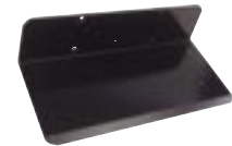
Steel Type C & D

Die-cast magnesium with recessed heel is 18" wide, 7 1/2" deep.